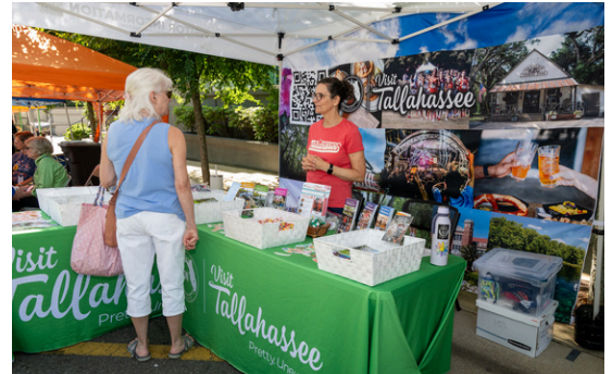
2025 Festival attendees learning about local offerings with Visit Tallahassee in the Festival's Community Corner area.

The Community Corner is all about making community connections! This key entrance of the Festival features Community Partners (local non-profits) and Brand Ambassadors (private businesses) who interact with thousands of visitors through free , educational, and hands-on activities, with a focus on sustainability and arts & culture in our community. As part of our "Greening the Festival" effort, visitors can learn about environmental sustainability from organizations such as Sustainable Tallahassee in this area. Visitors can often be seen walking around the Festival with their complimentary reusable tote bags from Community Partner, Rags2Bags, filled with festival goodies!