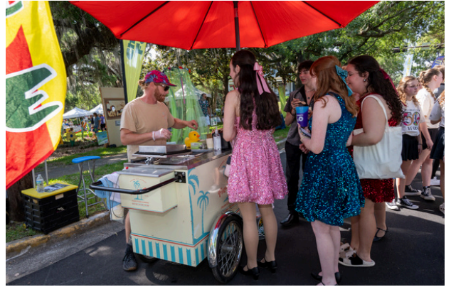
Fina Italian Ice cart in the Children's Park.

The Festival strives to have a wide variety of wholesome and delicious food with a preference for local food vendors who provide grab-and-go meals and refreshing snacks for visitors to enjoy throughout the day! Adults can also enjoy libations by PROOF Brewing, Distillery98, and specialty cocktails by McKibbon Hospitality at the Main Festival Bar.