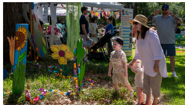
Getting creative in the Children's Park.