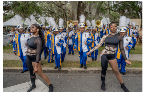
Rickards marching band performance in 2024.

The Chain of Parks Art Festival is delighted to welcome back the Rickards High School Marching Raider Band to energize festival-goers on Sunday, April 19 from 2:30–3:00pm. Starting at the Chalk Art Oasis entrance on Van Beck Lane, to the Center Court, down Zerbe Lane, then to the Children's Park, concluding on Tunnichiff Lane, this celebratory, community performance is an exciting way to wrap up the Festival weekend and witness the talent of our local Leon County School students.