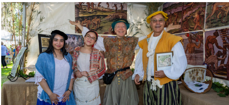
Jacques Le Moyne Encampment performed by Theater with a Mission.

Hosted by The Apalachee Center and in Partnership with Leon County Schools, the Children's Park (located in Randolph Park) is one of the most popular, family-friendly sections of the Festival! This free, interactive area is designed for thousands of kids to run, play, and use their hands to create their own works of art. This decorated area is facilitated by the Retired Art Teachers of Tallahassee group and is comprised of organizations that create engaging Pop-Up Art Studios, educational Local Culture tents, and features the historical Jacques Le Moyne Encampment with live historical reenactments by Theater with a Mission. Children can also enjoy performances and educational demonstrations by live entertainers, purchase refreshing snacks, experiment with chalk art, get their face painted, and more!