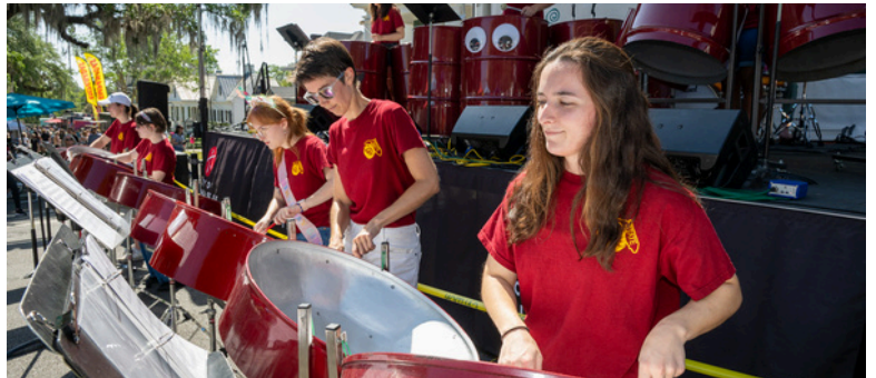
2025 Main Stage Performances