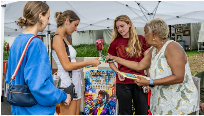
Community Partner, featuring the Black History Alliance interacting with 2024 Festival visitors.

The Community Corner features our Community Partners (local non-profits), Brand Ambassadors (local businesses), and Host-level Sponsor Booths that provide FREE interactive activities and information. These participants are located at the key entrance to the Festival on our Reid Gunn Lane. The purpose of this area is to promote non-profit organizations that promote sustainability and support the arts & culture in our community. As part of our "Greening the Festival" effort, visitors can learn about environmental sustainability from organizations like the FL Dept. of Environmental Protection and Sustainable Tallahassee. We loved seeing visitors walking around with their FREE reusable tote bags from Rags 2 Bags full of festival goodies!