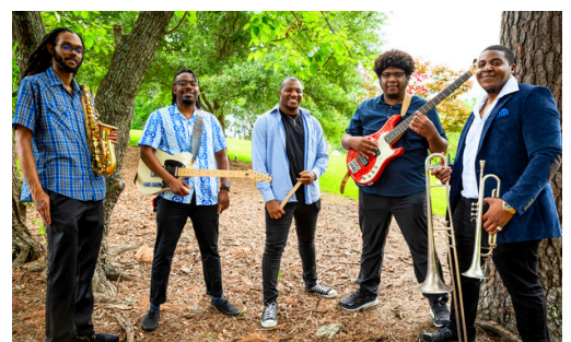
Pharaohs of Funk Band