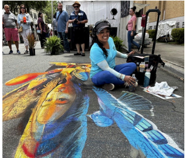
Chalk Art Oasis artwork