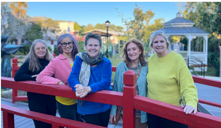
Members of the RATTs

The Children's Park is facilitated by the Retired Art Teachers of Tallahassee group and incorporates Pop-Up Studios, Interactive Art Vendors, Heritage Booths, the historical Jacques Le Moyne Encampment, Pop-up Entertainers, fun snack foods, and more!