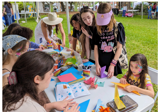
Kids crafting at a "Pop-Up Studio" in the Children's Park